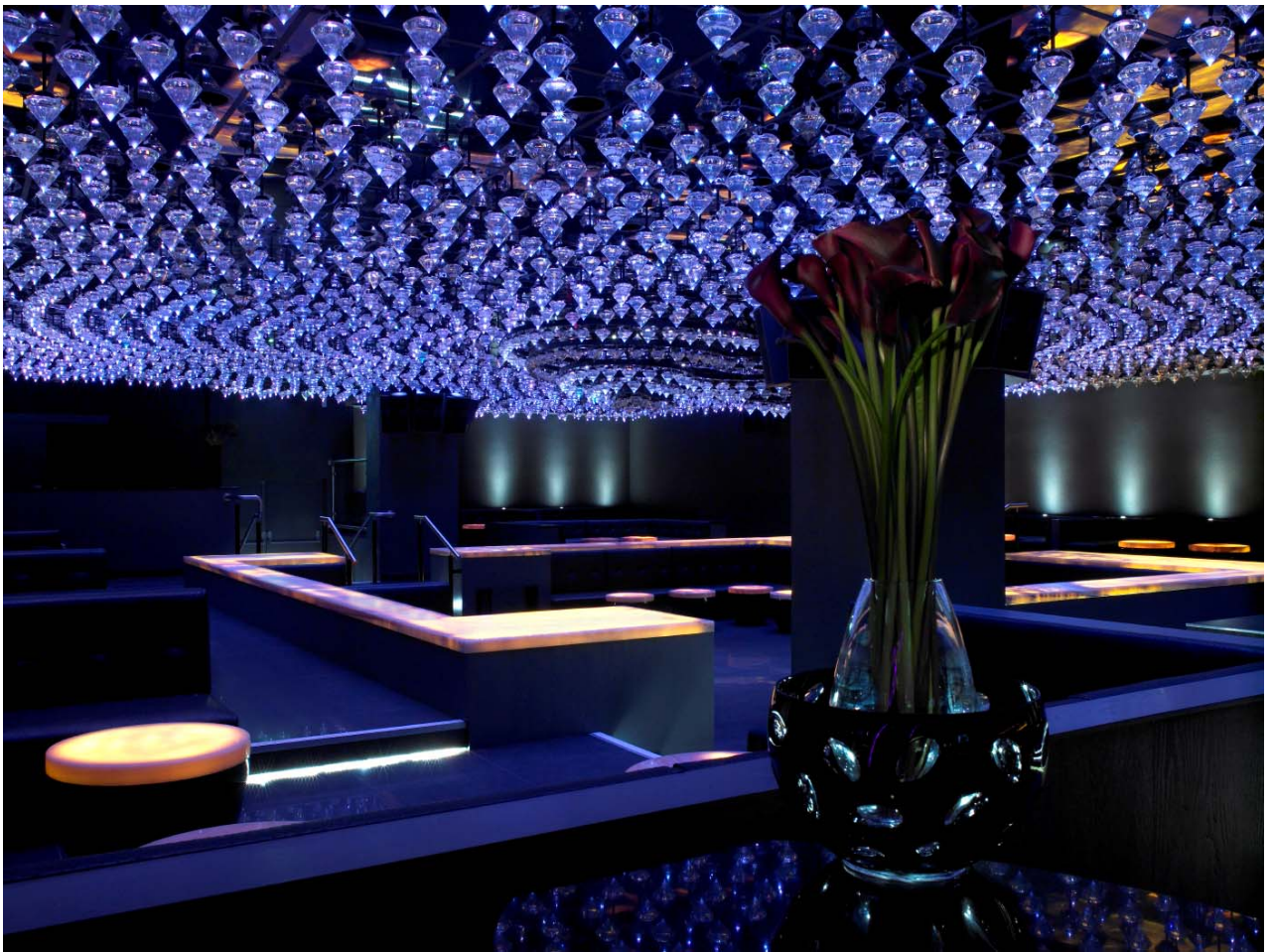
Amphitheatre of dancing space, 2008. Jalouse, Mayfair. DF001 = (dance floor + installation) 3 Onyx, composite, glass and mirror. 3000 sq ft.